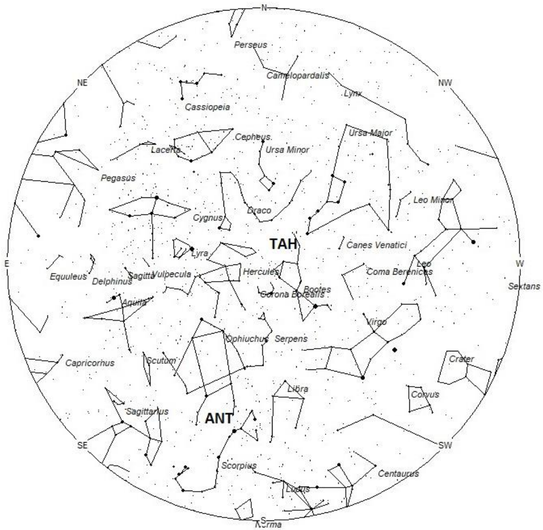
Radiant Positions at 01:00 Local Daylight-Saving Time