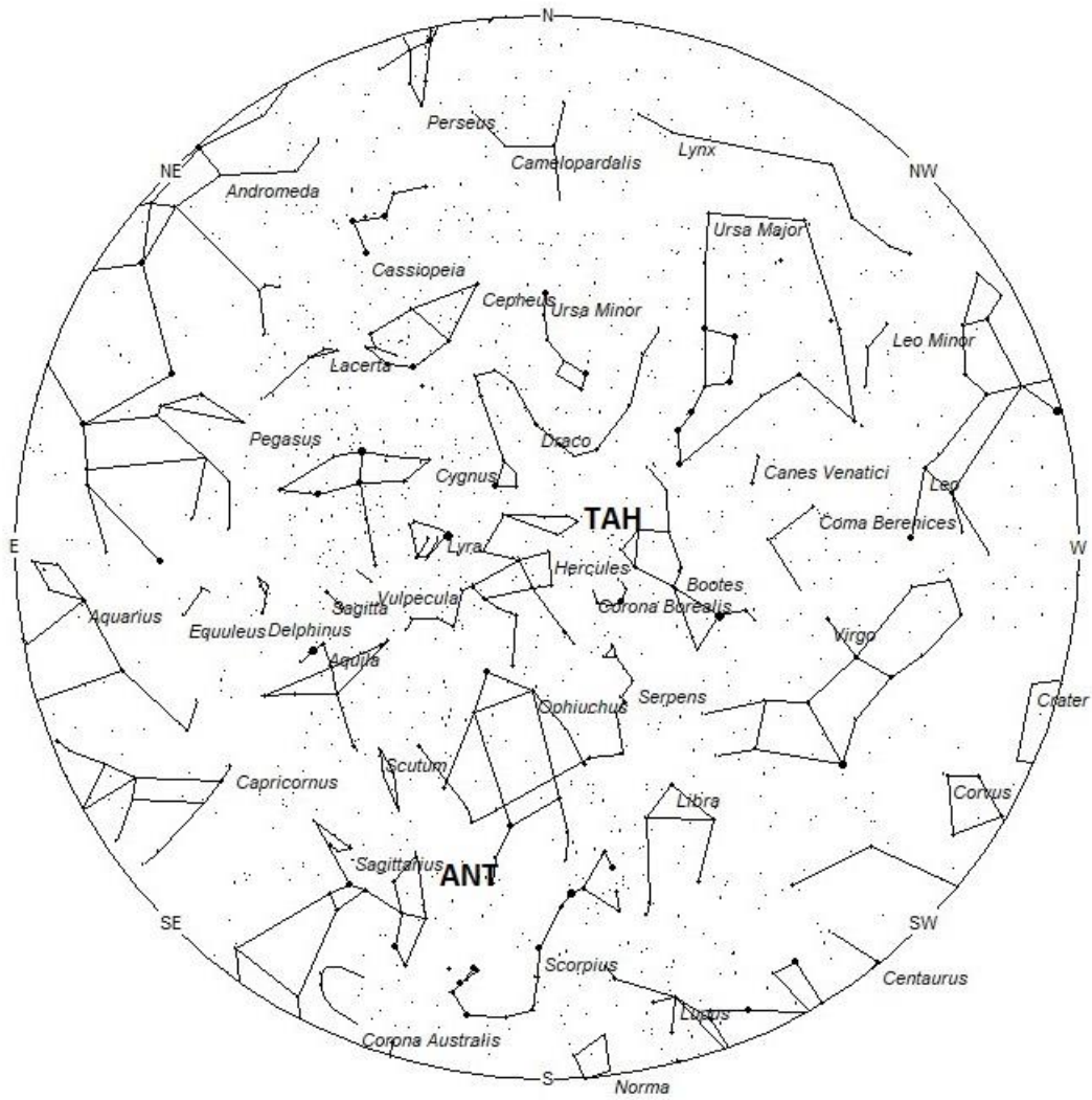
Radiant Positions at 1am Local Daylight-Saving Time